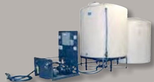
Fill stations and brine making systems