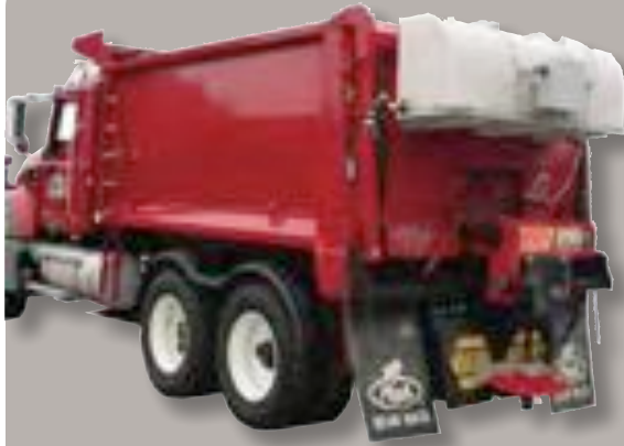
Salt pre-wetting systems